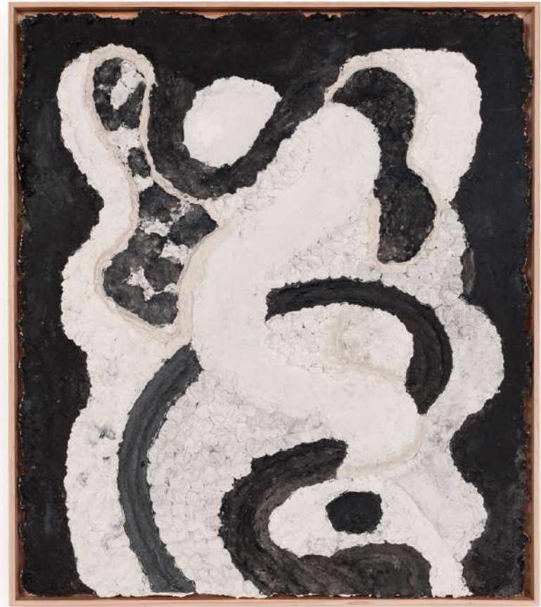
Moon Bathing Morgana Celeste

700 x 600mm Paper, Plaster and Acrylic, Framed in Tasmanian Oak