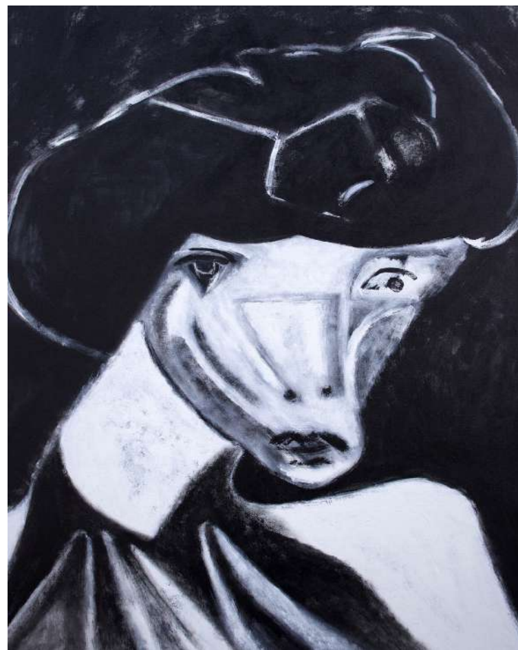
Lark Stacey Rees 915 x 765mm Acrylic on Canvas $2950