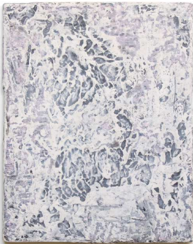
I Cement What I Said