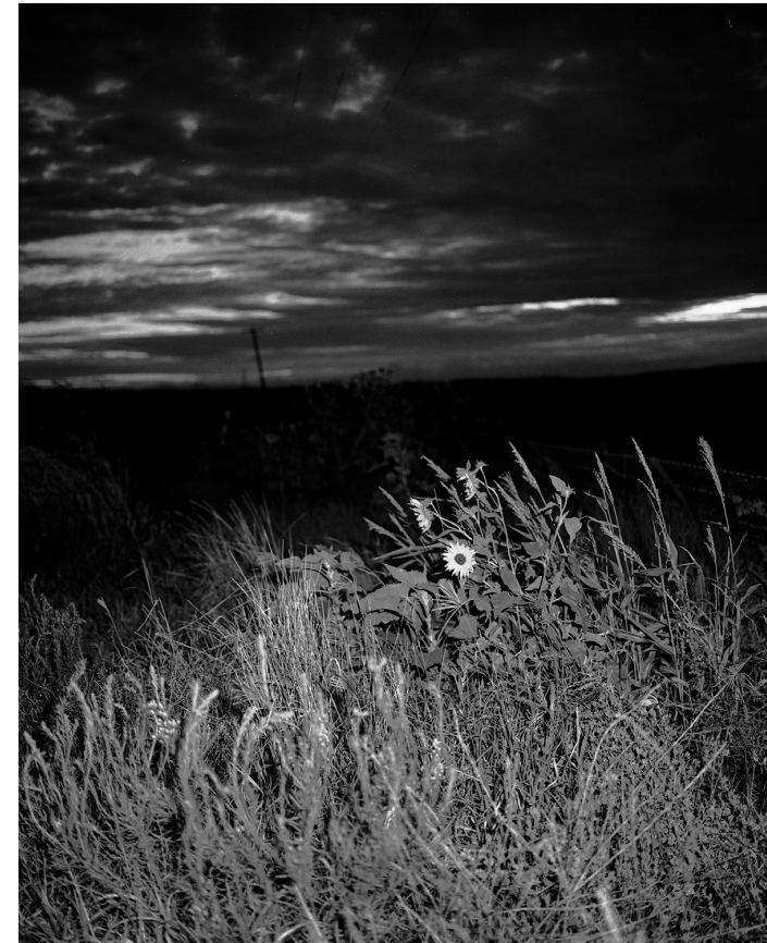
Sunday Diver Mitch Pinney

625 x 500mm Giclee Print on Ilford Gold Fibre Pearl (edition of 5), Framed