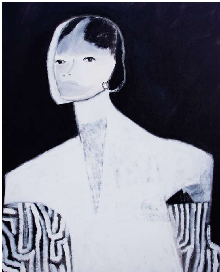
Rush Stacey Rees 915 x 765mm Acrylic on Canvas $2950