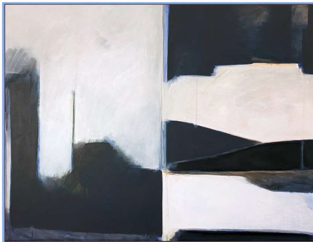
Earl Morning After A Storm