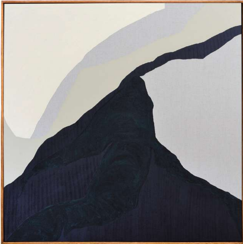
Winged Water Beast Hannah Nowlan

900 x 900mm Oil on Linen, Framed in Tasmanian Blackwood