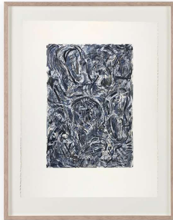
Garden Needs Watering Liam Haley

760 x 560mm Ink, Watercolour, Gouache, Pencil and Crayon on Paper, Framed