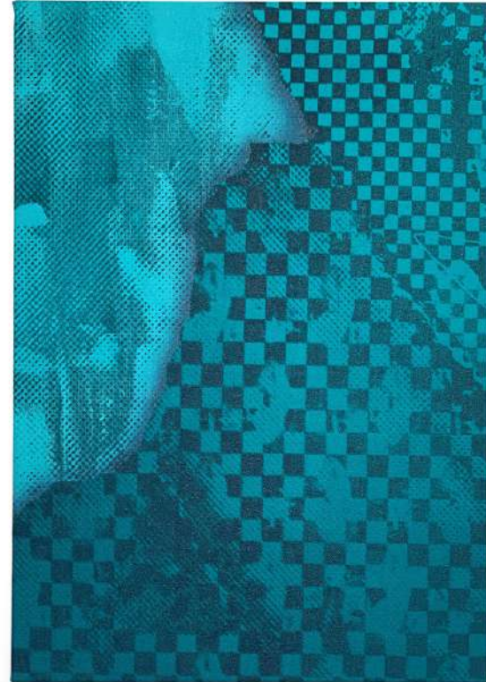
Ctrl+P34 Ingmar Apinis

550 x 355mm Acrylic Screenprint on Canvas