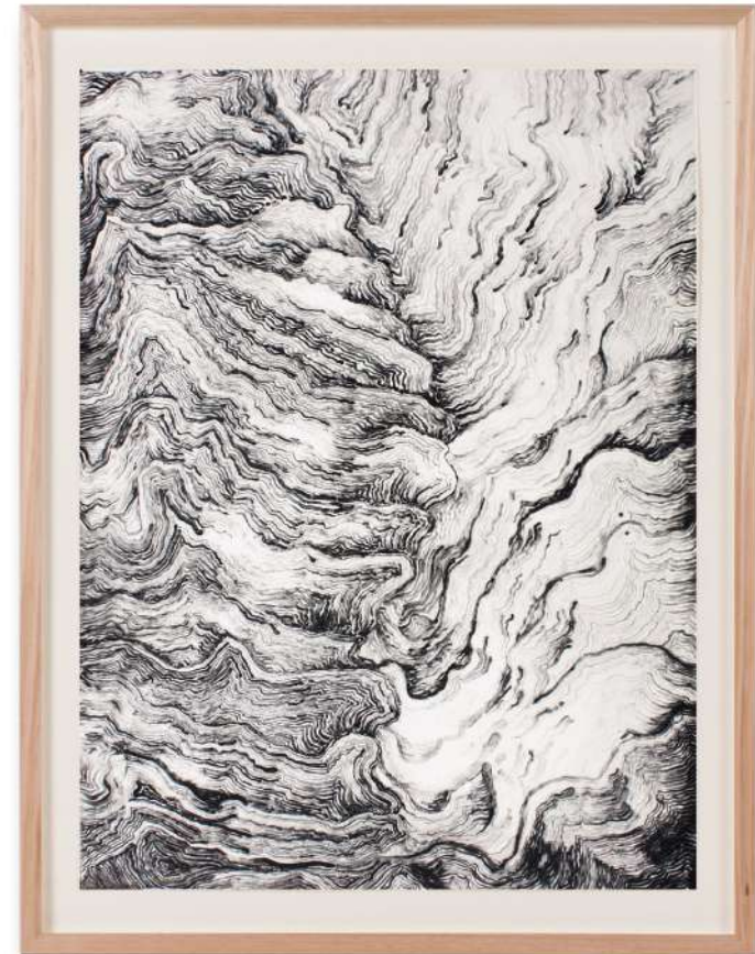
Groove Jennifer Tarry-Smith

760 x 560mm Lithograph (edition of 5), Framed