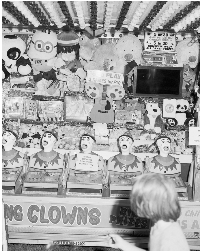
Summer Carnival Mitch Pinney

625 x 500mm Giclee Print on Ilford Gold Fibre Pearl (edition of 5), Framed