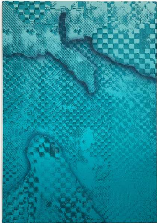
Ctrl+P33 Ingmar Apinis

550 x 355mm Acrylic Screenprint on Canvas