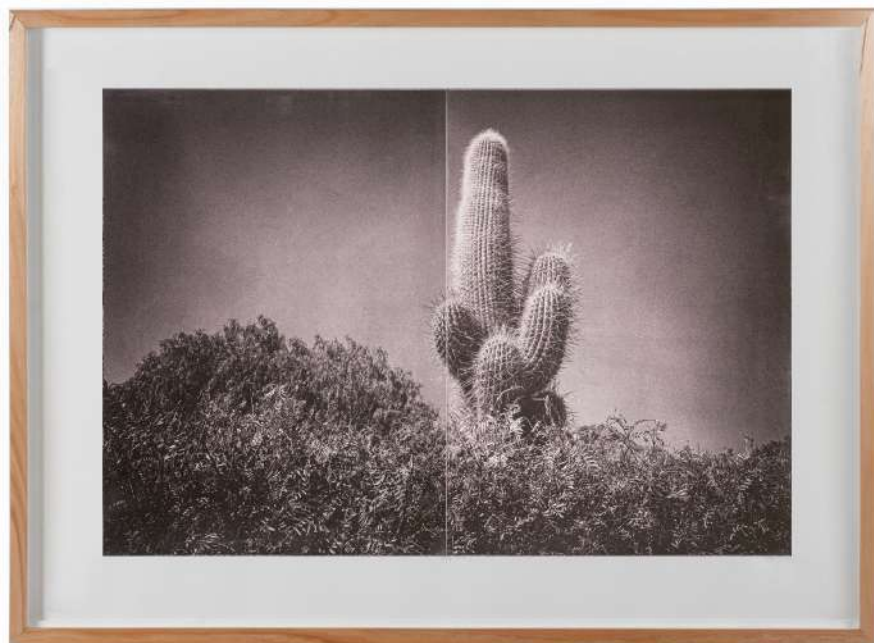
The Shade of a Cactus 2