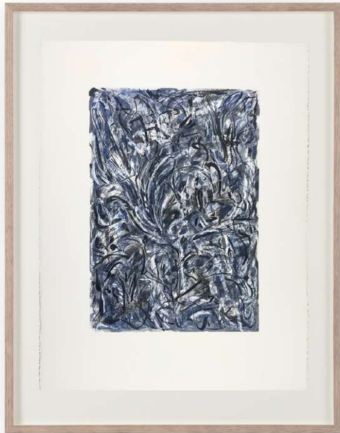
Shuffle Liam Haley

760 x 560mm Ink, Watercolour, Gouache, Pencil and Crayon on Paper, Framed