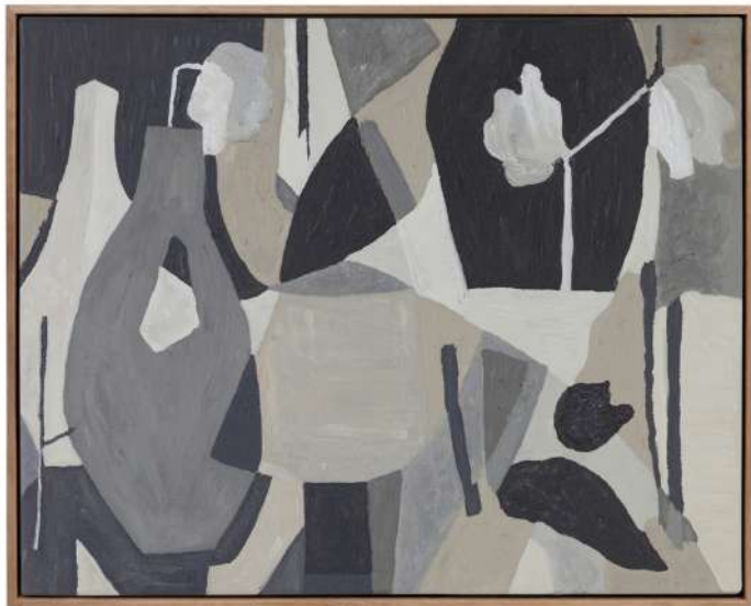
Morning Forage Charlotte Swiden

410 x 510mm Oil, Acrylic and Pastels on Linen, Framed in Tasmanian Oak