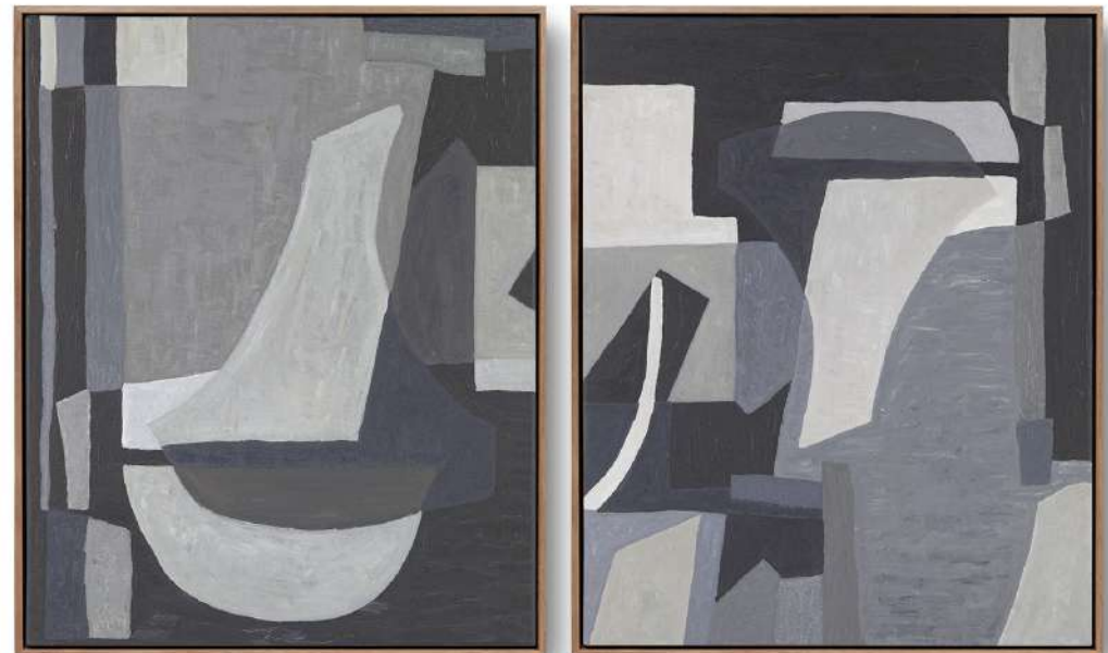
Night Swims / Reflections Charlotte Swiden

510 x 410mm each, Sold as a Pair Oil, Acrylic and Pastels on Linen, Framed in Tasmanian Oak