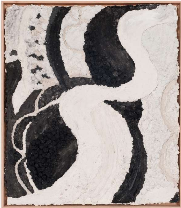
Dark Adaption Morgana Celeste

700 x 600mm Paper, Plaster and Acrylic, Framed in Tasmanian Oak