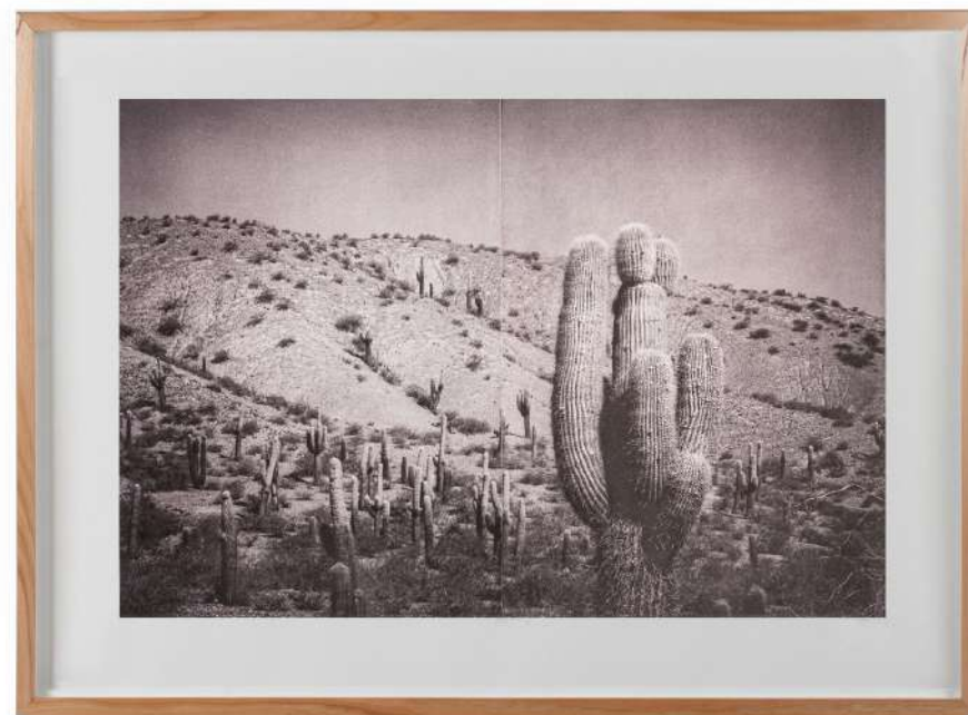
The Shade of a Cactus 5