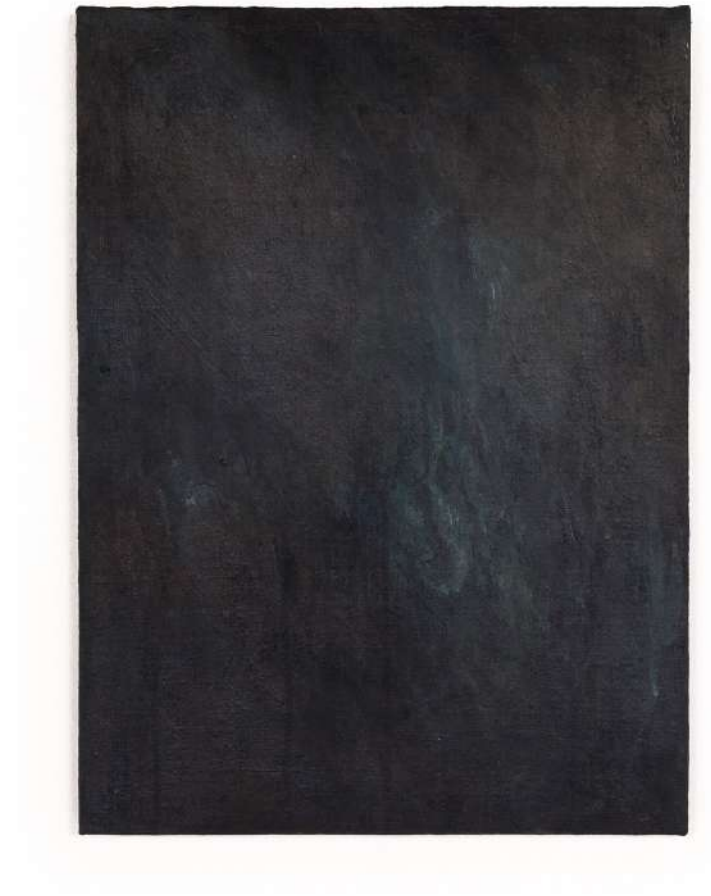
Hello Darkness, My Old Friend Ria Green

600 x 440mm Gouache, Watercolour, Ink, Oxide, Dye, Plaster and Textile on board